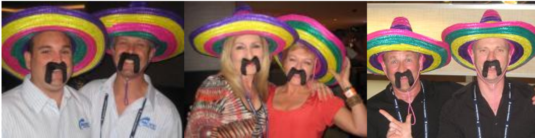
Below: Pacific team having fun at the IAA Mexican fiesta!

The IAA Gala Awards Dinner was held on the final night, and it was an amazing event with a hilarious impersonation of PM Julia Gillard and the ex PM Kevin Rudd.